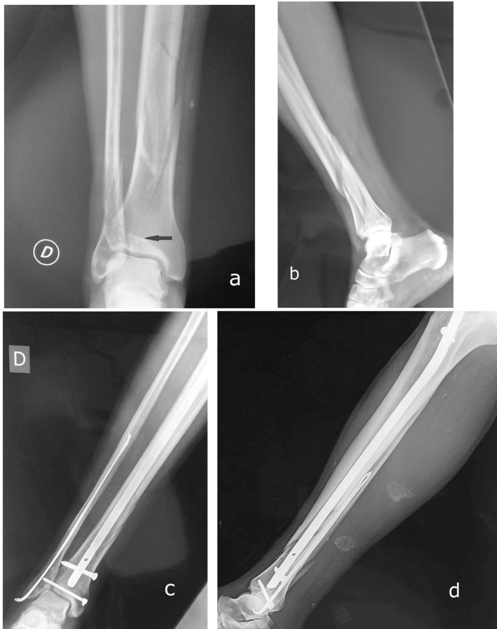
Fig. 2 AP and lateral view of the left ankle ( a and b ) showing quart distal fracture type A3 according to AO-OTA classification with a simple articular involvement (arrow). This fracture treated with intramedullary nailing associated an additional screw fixation and fibula fixation by pin ( b and c )

At the last follow-up, malunion occurred in 13 cases (14.4%). Among these cases, there were seven cases of