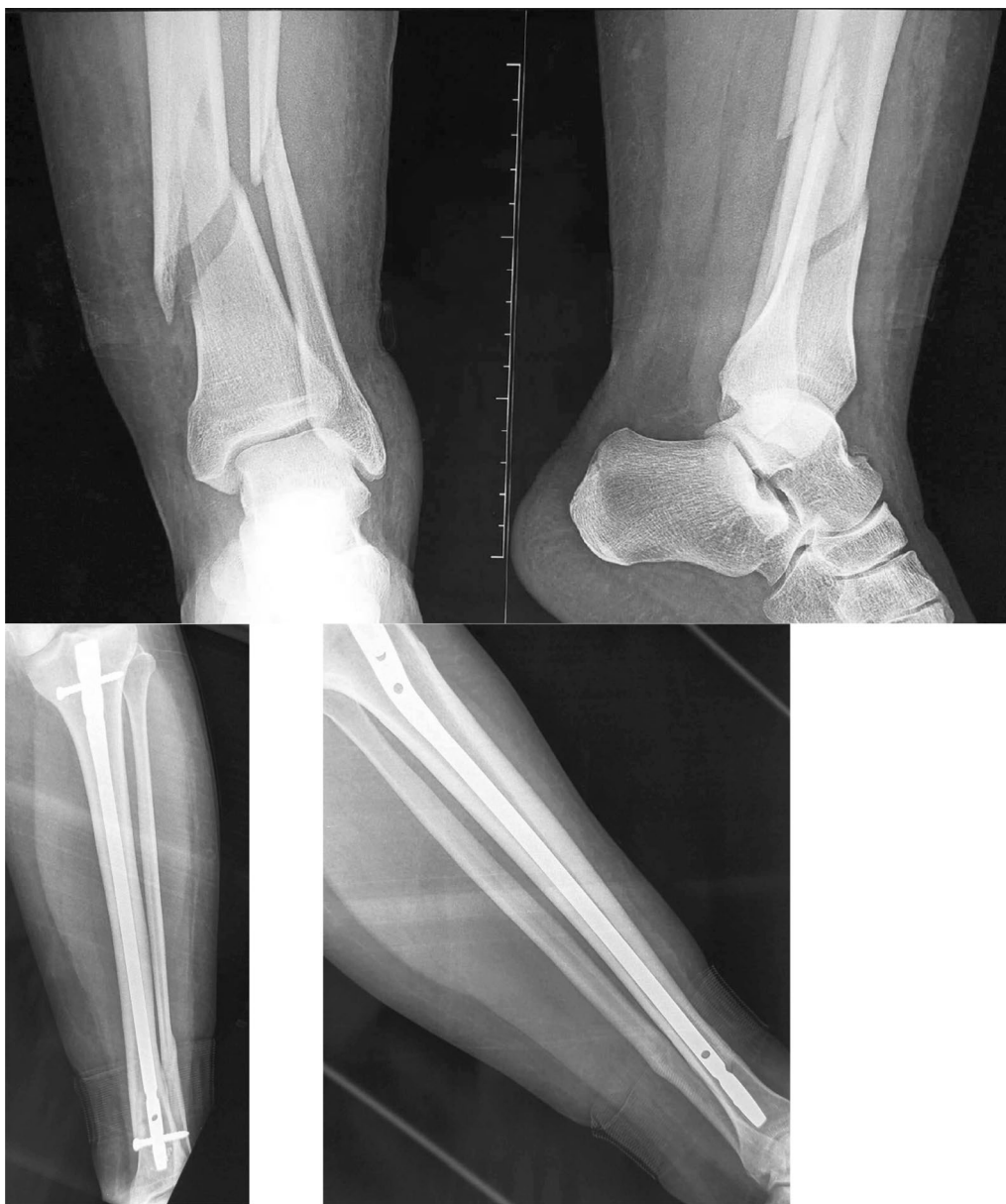
Fig. 3 Distal tibia fracture, treated by intramedullary nailing, healed with good alignment

varus malalignment, one case of associated limb shortening, one case of valgus malalignment and four cases of apex anterior angulation including one associated external rotation (Fig. 4).