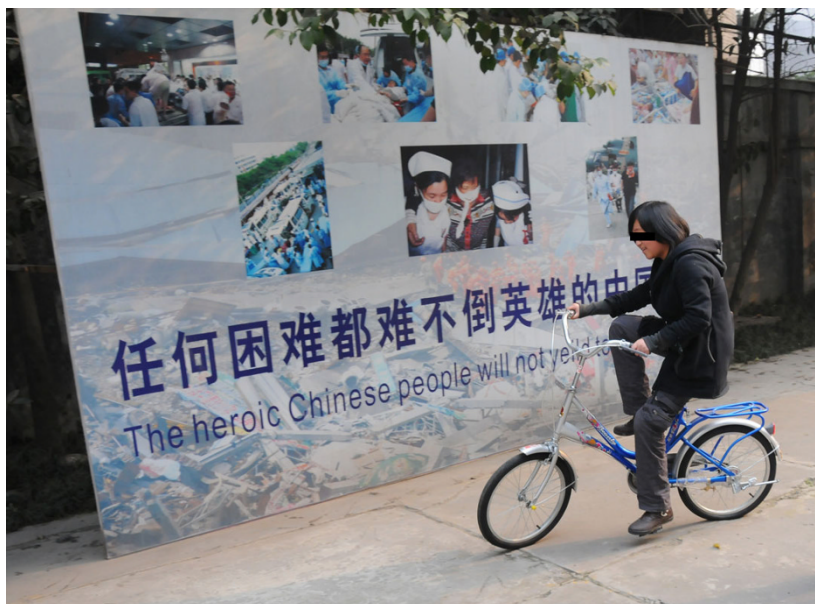
Figure 8 Functional activities training.

The joint efforts of the multidisciplinary team and the advancement of new technology have revolutionized the care process for amputees. The loss of a limb may not