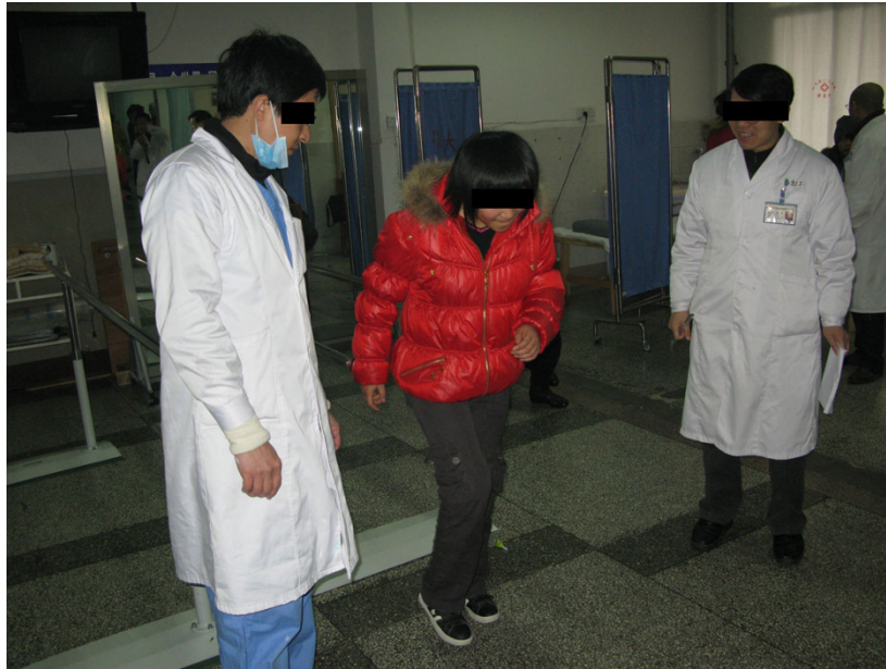
Figure 7 Jumping activities training.

her daily activities. During the first year ceremony of the Sichuan earthquake, she was invited to come to Hong Kong by “Stand Tall”, and was interviewed by various media outlets, including the international news agency CNN. There she presented her views on the injury and rehabilitation process.