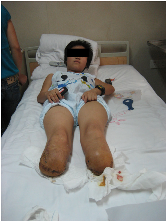
Figure 5 The patient with bilateral transtibial amputation.

Attributable to pain and weak trunk musculature she was highly dependent on medical staff, requiring manual assistance for bed mobility and transfers. She could neither sit unsupported nor tolerate prolonged supported sitting. This patient then underwent stages of rehabilitation and functional training under the rehabilitation team.