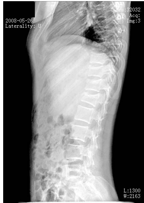
Figure 2 Pre-operative radiograph (lateral view) with thoracolumbar vertebral collapse.

Due to prolonged bed rest, she had developed sacral sores and bilateral hip flexor contractures. Her bilateral lower limbs mobility and power had also decreased.