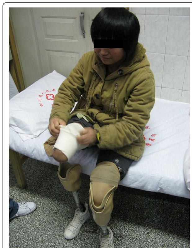
Figure 6 The patient self donning and doffing her prostheses.

In prosthetic fabrication, the communication with other rehabilitation team members was necessary to adjust the prosthetic setting to provide optimal fitting. The capability of functional improvement should be explored through the prostheses refinement process. The biomechanical factors, such as dynamic alignment, were adjusted to match her physical condition. By reviewing the progress of the patient, feedback and professional opinion from therapists, enhancement was