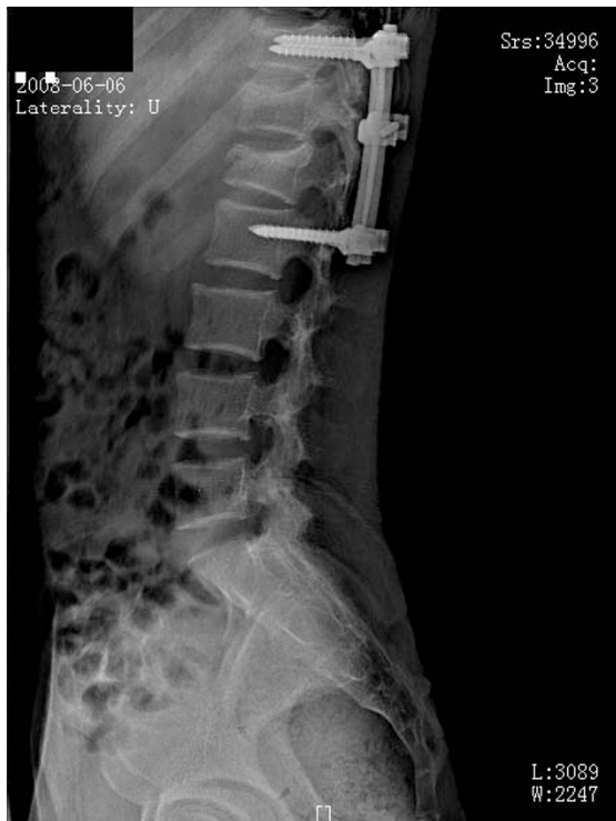
Figure 4 Post-operative radiograph (lateral view) with posterior spinal fusion performed.