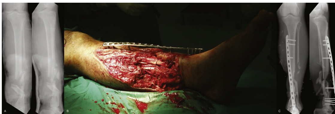
Figure 3 a - Comminuted Gustillo-Anderson IIIB open diaphyseal fractures of the right tibia and fibula. b - Exchange external fixation performed with LCP contoured to facilitate soft tissue coverage. c - Postoperative radiograph of LCP external fixation.

fixator was performed on admission. After 72 hours, he underwent re-look and repeat debridement. Five days after the initial injury, vacuum-assisted closure dressing (VAC; Kinetic Concepts, Inc, San Antonio, Tex.) was applied. The following day, the external fixator was exchanged for an 18-hole 4.5 mm combination LCP (Synthes Inc, Paoli, PA) (Figs 3b & 3c). Plastic surgical consult was obtained to best site the fixator where it would not be in the way of later soft tissue coverage. A gentle twist was imparted to the plate to improve distal bone fragment purchase. He underwent 11 further debridements owing to wound colonization with Acinetobacter baumannii , and later, methicillin-resistant Staphylococcus aureus (MRSA). Soft tissue resurfacing was finally achieved with a combination of split-thickness skin graft and free dermal graft. He was discharged one month after the original operation. At six months, fibula pro tibia grafting was performed for delayed union resulting from bone loss at the fracture site. The fibula graft was compressed and secured to the tibia with two cortical screws, with the LCP external fixator left untouched. While the LCP external fixator was in place, there were no signs of local screw-site sepsis or screw loosening.